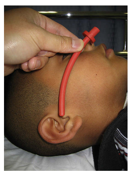
Fig. 5. Measuring correct length of nasal airway.

says "squeeze," and then the provider's hand relaxes to allow for the bag to re-expand during exhalation as the provider says "release, release."<sup>14</sup>