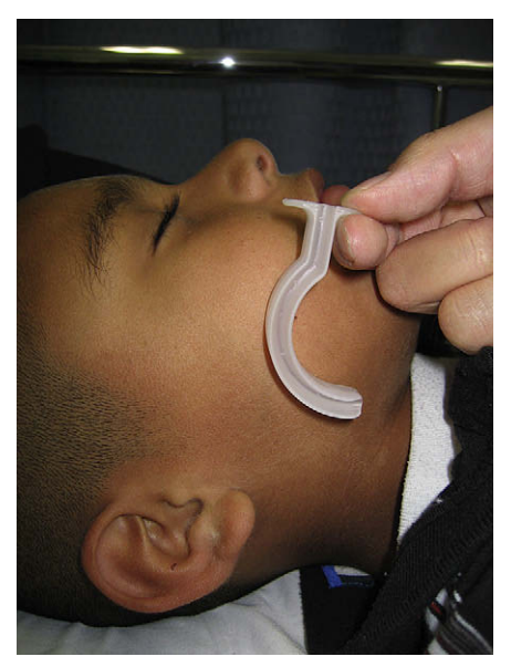
Fig. 4. Measuring correct length of oral airway.

adenoids and tonsils can be traumatized during insertion, resulting in bleeding. The nasal airway should be inserted with the bevel pointed away from the nasal septum to minimize risk of bleeding. Correct length can be determined by placing the airway along the side of the face extending from the nostril to the tragus of the ear, and the width of the nasopharyngeal airway should be less than that of the nostril ( Figs. 5 and 6 ).