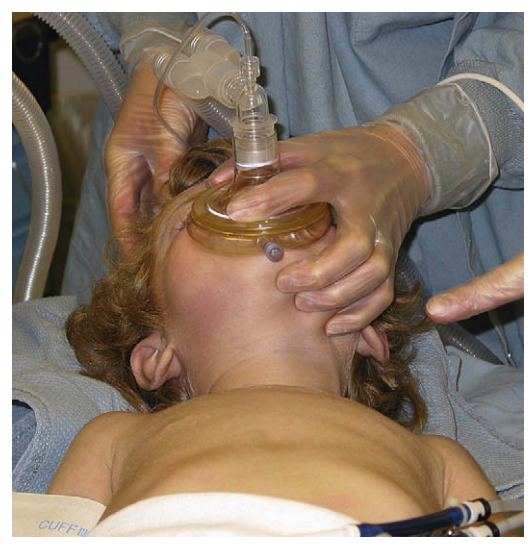
Fig. 7. E-C clamp method of ventilating patient with a bag-valve mask. Notice that the physician is lifting jaw into mask.

during the Sellick maneuver. Care must be taken to avoid obstructing the tracheal lumen or distorting airway landmarks with excessive pressure; if the intubator cannot visualize the airway (only pink mucosa is seen), it may be that excessive cricoid pressure is being used.